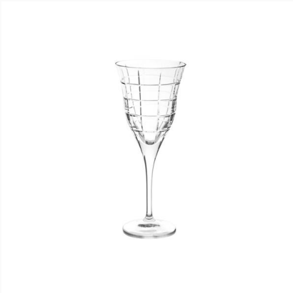
Mario Cioni Giulia 351, Crystal Cut Wine glass