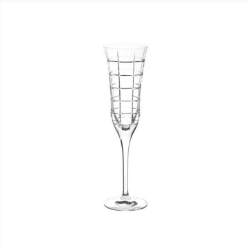
Giulia 351, Crystal Cut Champagne Flute