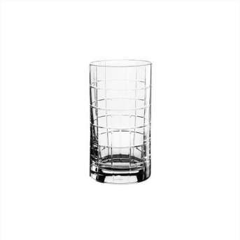
Mario Cioni Cili, Crystal Cut High Ball